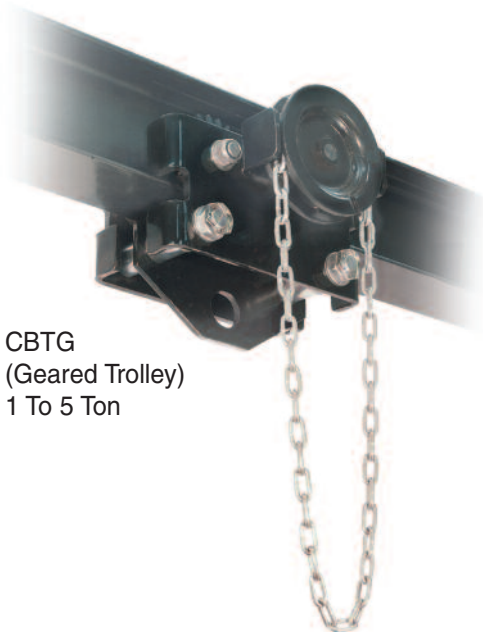
CBTG (Geared Trolley) 1 To 5 Ton